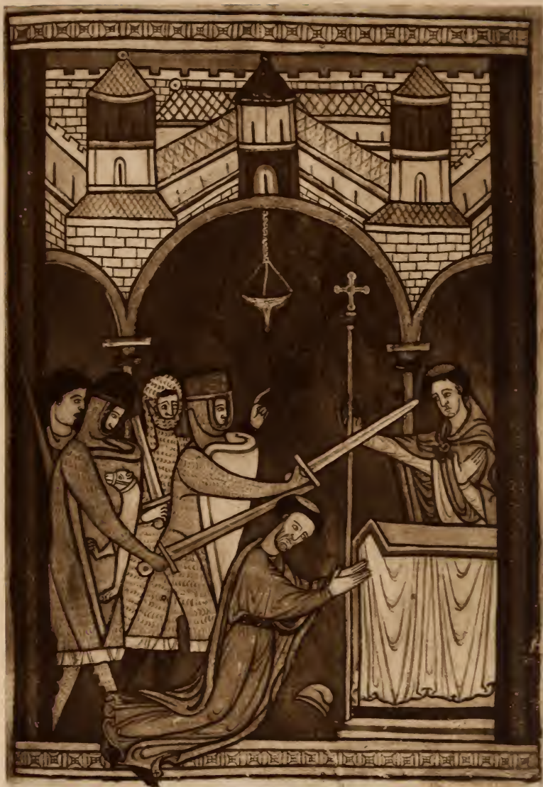
The Death of St. Thomas of Canterbury Reproduced from a Norman French Manuscript of the XIII Century (ms. 100.11)